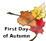
Autumn Begins Sept. 23 rd