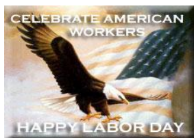
Labor Day Sept. 5th