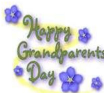
Grandparent's Day Sept. 11 th