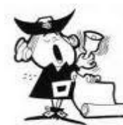
Town Meeting Sept. 14 th